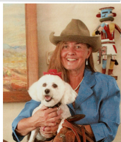
CHA CHA DONAU