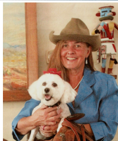
CHA CHA DONAU