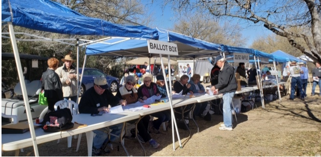
Our very busy ballot counters