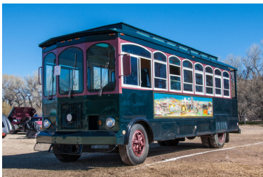
New Entry this year Nogales trolley