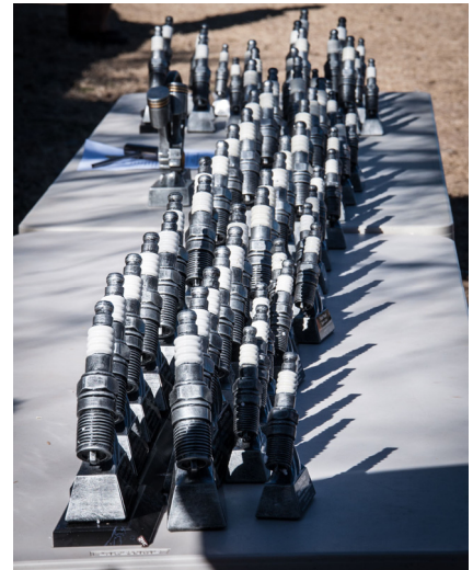
New trophies Spark Plugs for winners