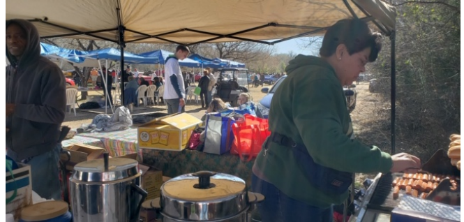
Our special cook in charge of student food