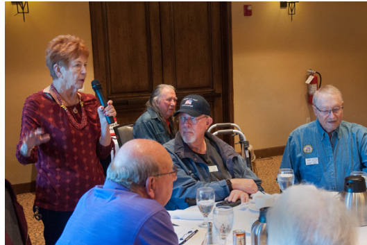
Chevy Club member talking about the Chevy Show-down